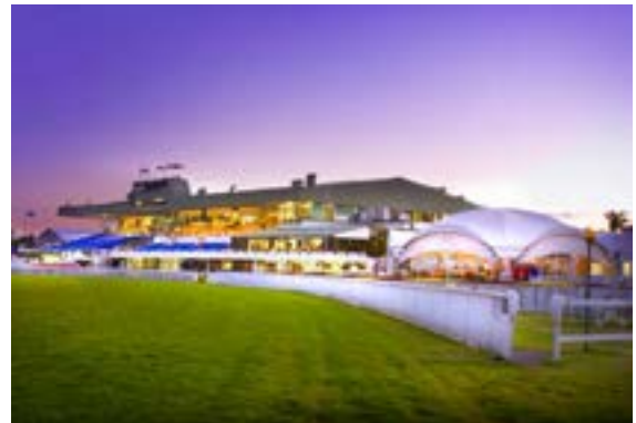
GOLD COAST TURF CLUB