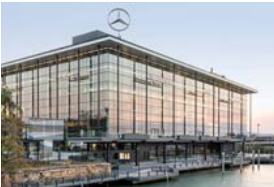
MERCEDES BENZ BRISBANE