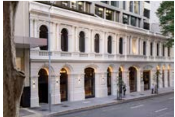
RIO TINTO, BRISBANE OFFICE