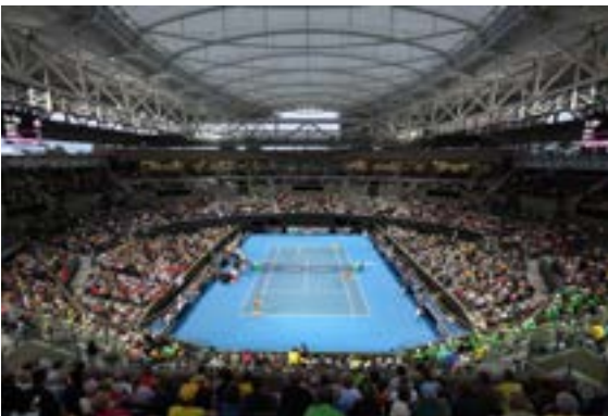
PAT RAFTER ARENA