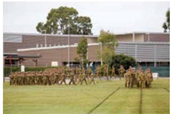
DOWNER - MILITARY BASES

BRISBANE AIRPORT PAT RAFTER ARENA DOWNER MERCEDES BENZ BRISBANE JONES LANG LASALLE RIO TINTO SECURECORP GOLD COAST TURF CLUB FRASER PROPERTY GROUP NISSAN ARENA ...AND MANY MORE!